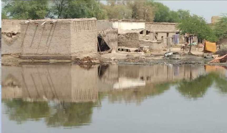
District Jacobabad: VO Chandam, UC Mirpur Thull Jacobabad