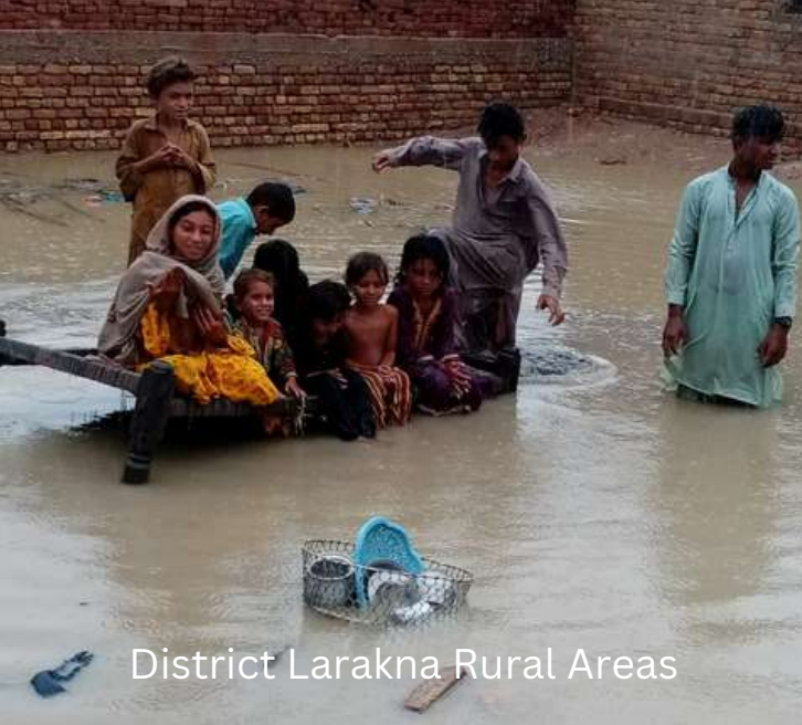
District Larakna Rural Areas