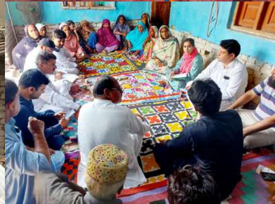
NPGP-PMU team conducts FGD in rain flood affected area, village Lakhi Aqil UC Wazeerabad Tehsil Lakhi District Shikarpur