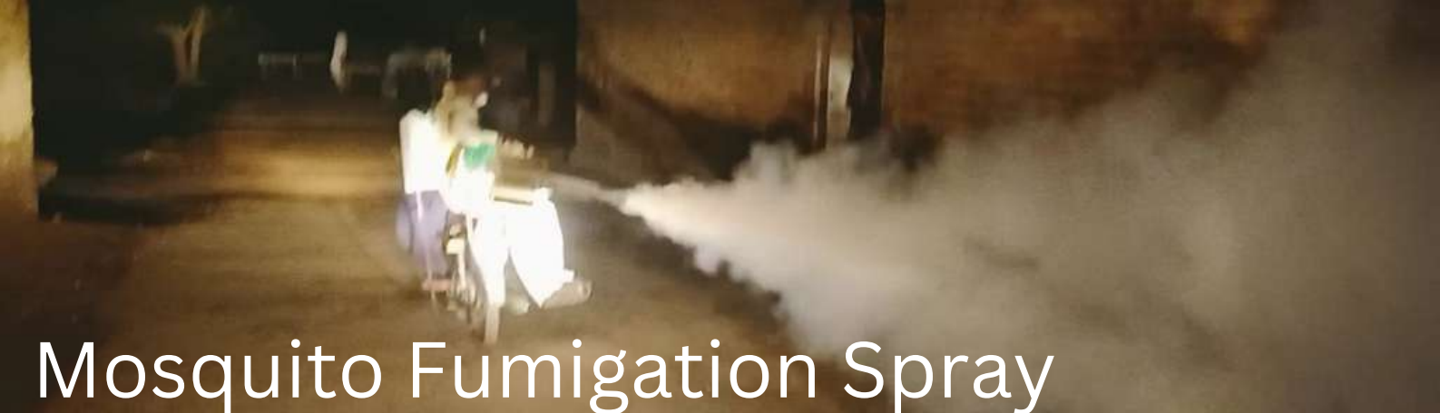
Mosquito Fumigation Spray