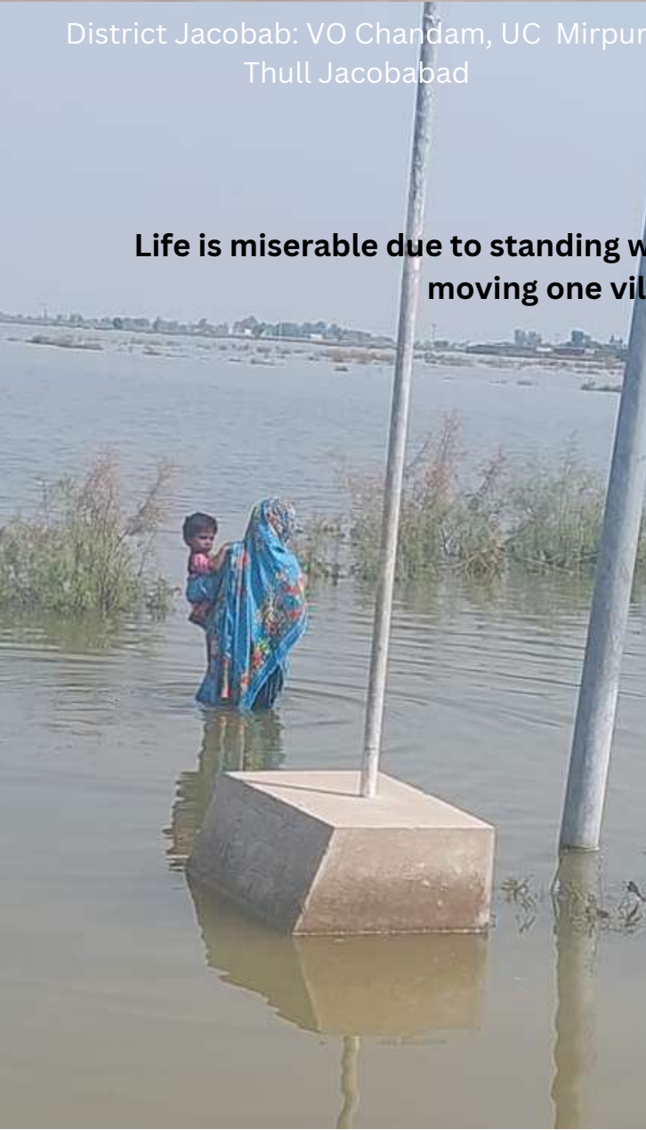
Life is miserable due to standing water, Women have to cross the water from moving one village to another village