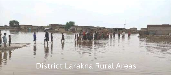
District Larakna Rural Areas